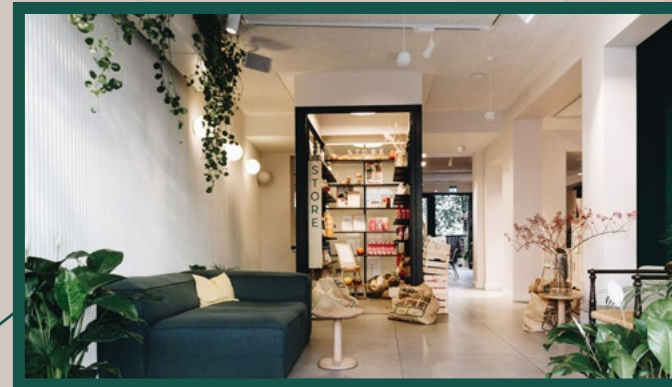
Frontal view from the street level.