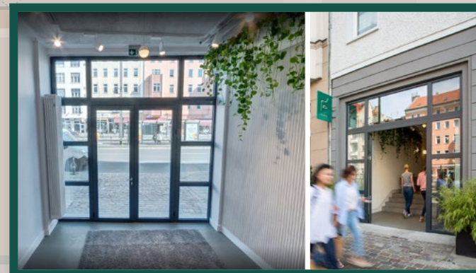
External glass window display 3,5m (w) x 3,5m (h).