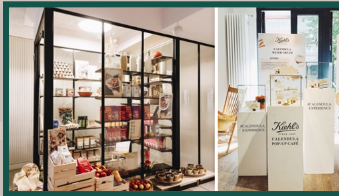
Internal display area for pop-up with great visibility throughout the venue.